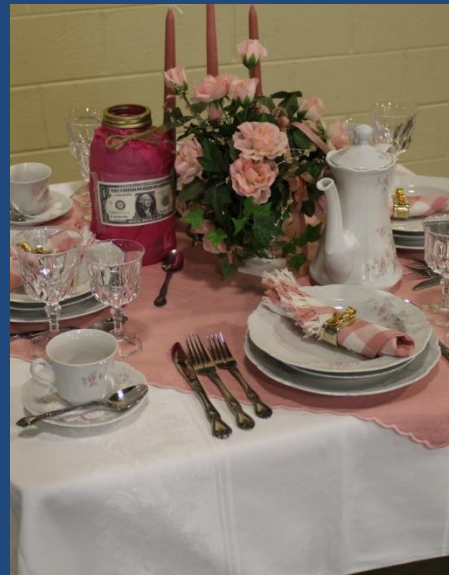
Pictured above is the winning table!