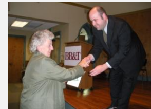
Logan RSVP representative