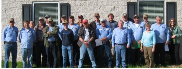
Community Action's Weatherization Team