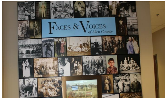
Photos above include the ribbon cutting by the Scottsville Chamber for the Newseum Exhibits, Western Kentucky University students working on a folk life oral history project for Allen County and the Faces & Voices of Allen County display & interactive kiosk.