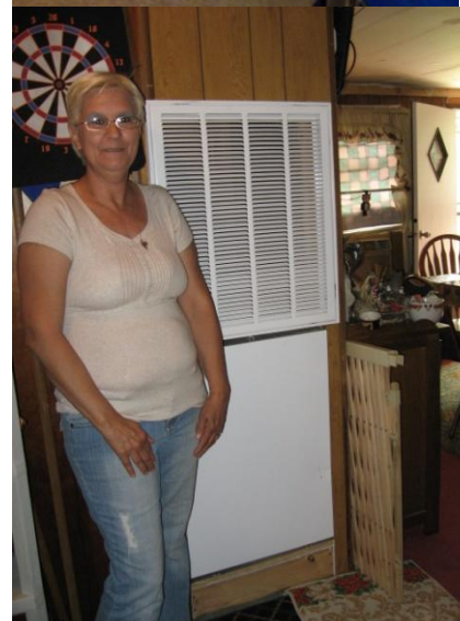
Pictured above are two happy Weatherization clients with home weatherized last year.